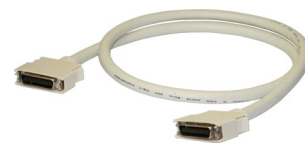
CMC-3 Matrix Cascade

For Special Configurations Please Contact our Sales Department on Tel +44 (0) 2380 529303