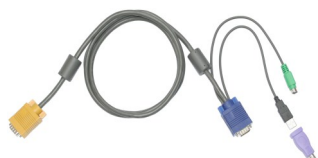
CE-6 All in one KVM Cable