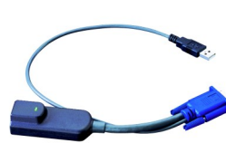
DG-100S USB Dongle