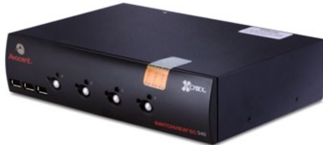
The SC 300 series switch is available in 2, 4 and 8 port configurations

In addition, the SC 300 series switch allows a full range of USB peripherals to accommodate any environment